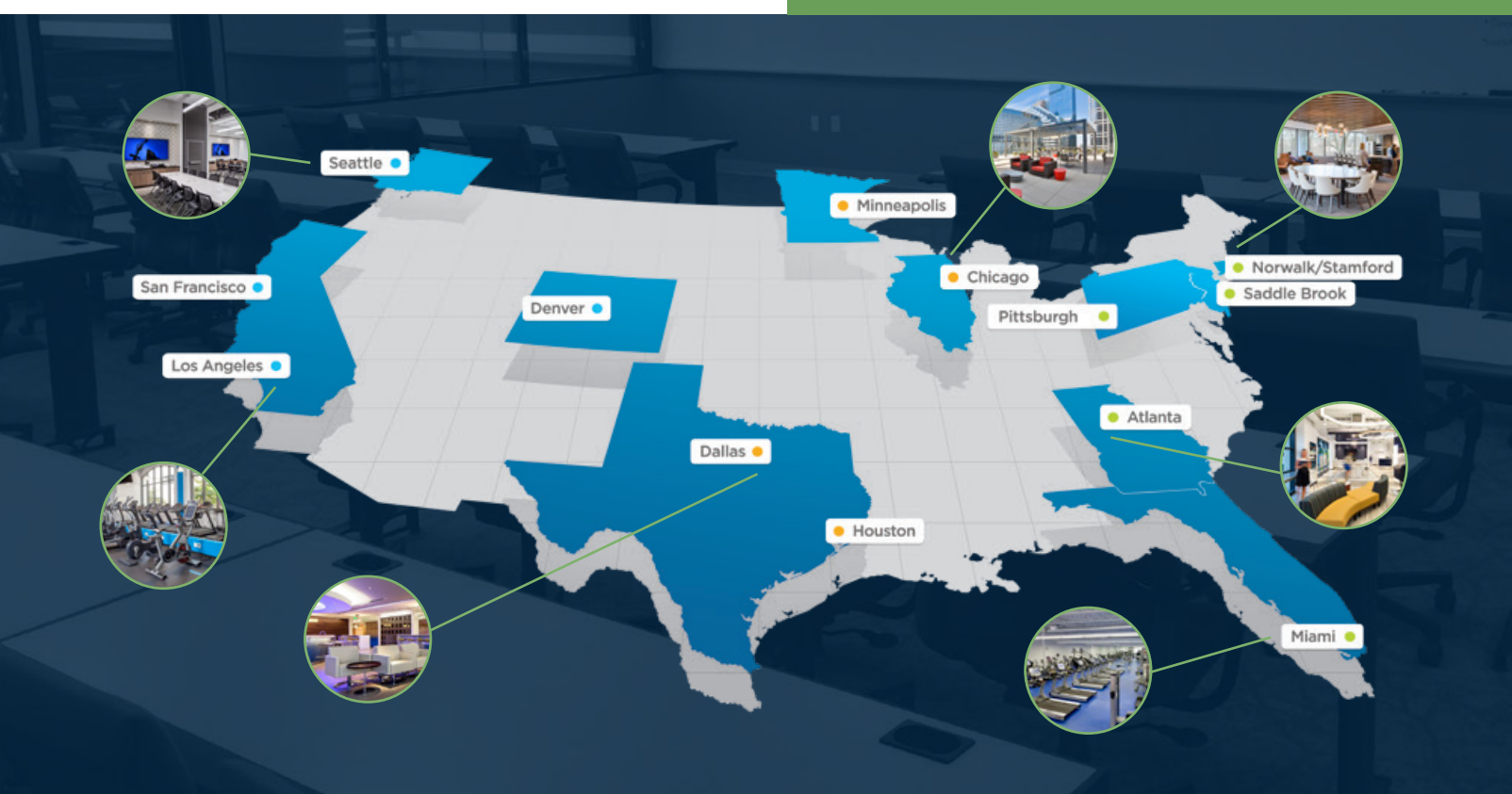
Learn more at www.5-starworldwide.com