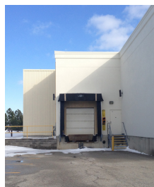
Single Truck Level Loading Dock