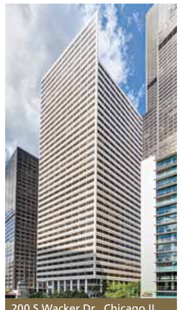
200 S Wacker Dr., Chicago IL