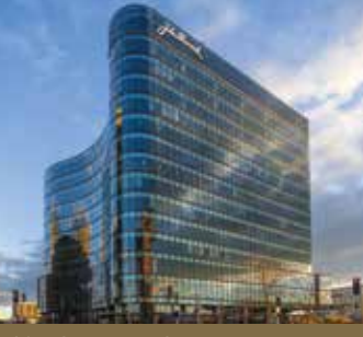
601 Congress St., Boston MA