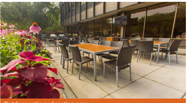
Outdoor patio and seating area