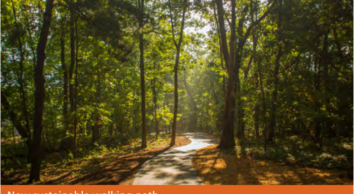
New sustainable walking path