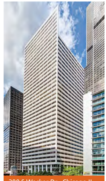
200 S Wacker Dr., Chicago IL