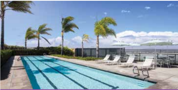
Heated lap pool