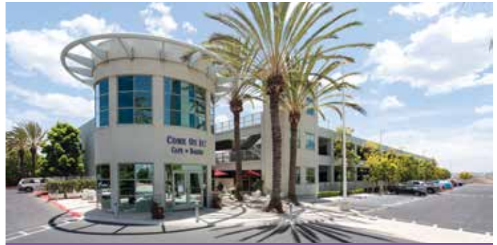
On-site parking garage and gourmet café