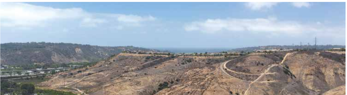
View from Seaview Corporate Center